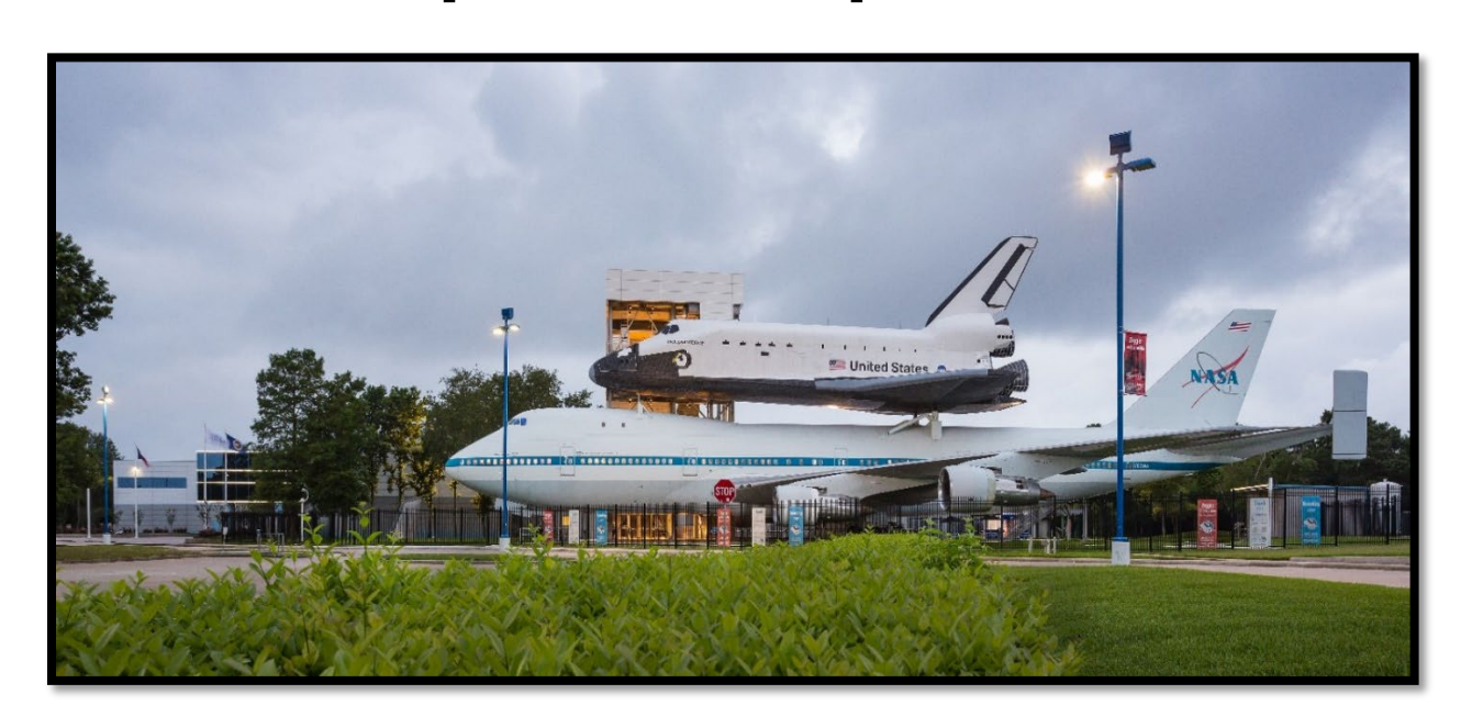
My camp adventure at Space Center Houston